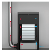
Vertiv™ VRC Rack Cooling System, 3500 Watts