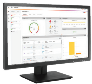
Vertiv™ Environet™ Alert