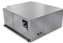
Liebert® Mini-Mate Ceiling-Mounted Cooling System, 3.5-28 kW