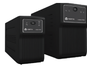
Liebert® PSA5 500-1500 VA Line-Interactive UPS