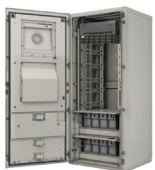
Vertiv™ XTE 801 Series Network Edge Enclosure

Increase power system density for ensured continuity as you scale distributed assets to meet growing demand.