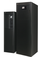
Liebert® EXS 3PH 10kVA, 208V UPS