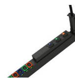
Vertiv™ Geist™ Universal Power Distribution Unit