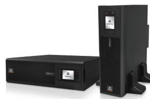
Liebert® ITA2 3PH 10kVA, 208V UPS