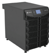
Liebert® APS 5kVA - 20kVA Modular UPS