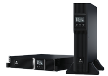
Liebert® PSI5 1500-3000 VA Lithium-Ion Line-Interactive UPS