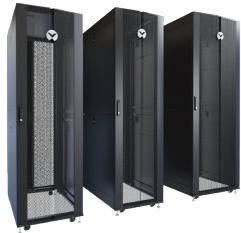
Vertiv™ VR Rack

Support and protect your critical IT and facilities with scalable, modular equipment storage solutions.