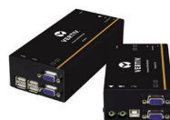
Vertiv™ Avocent® LongView™ KVM Extender