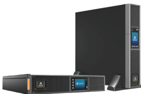
Vertiv™ Liebert® GXT5 500-10,000 VA Online Double Conversion UPS