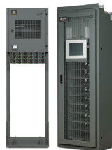
NetSure™ DC Power Solutions