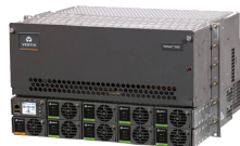
NetSure™ DC Power System for Wireless Access