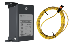
Liebert® Point Leak Detection Sensors and Cable