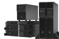
Liebert® PSI5 750-5,000 VA AVR Line-Interactive UPS