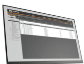
Vertiv™ Avocent® DSView™ Management Software