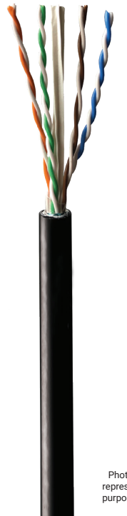
Photo is for representation purposes only.

*Frequencies beyond the TIA and ISO requirements are for information only. All values are dB/100m.