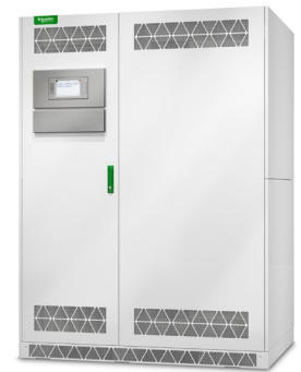
400 & 500 kVA